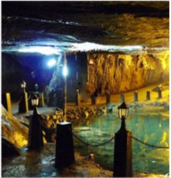
Mythological Cave Visits